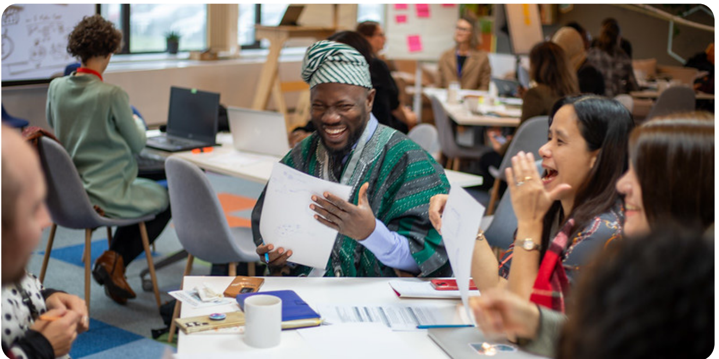
International Civic Forum 2023 in Brussels